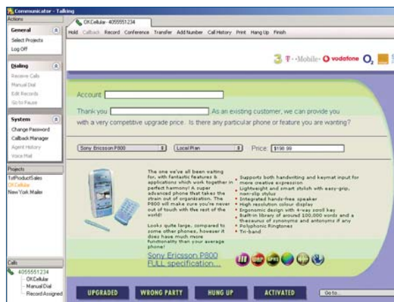
...which your agents can use to improve productivity & service.

Noble Communicator & Communication Designer were named "Product of the Year 2006" by Customer Interaction Solutions magazine.