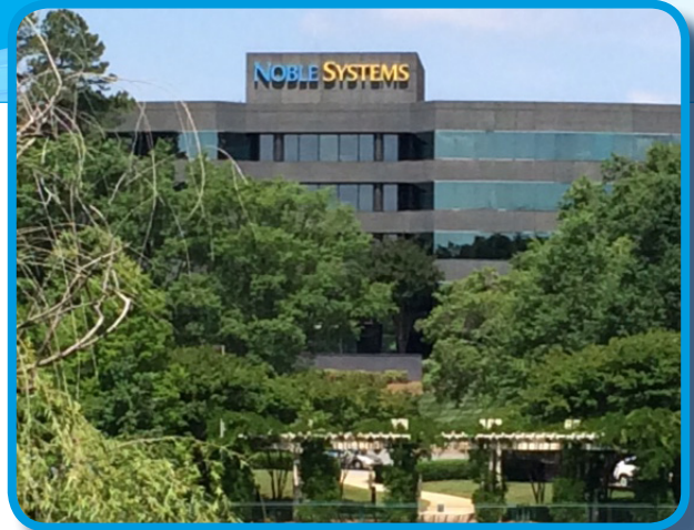
Noble Systems Corporation 1200 Ashwood Parkway Suite 300

1.404.851.1331 | 1.888.866.2538 www.noblesystems.com